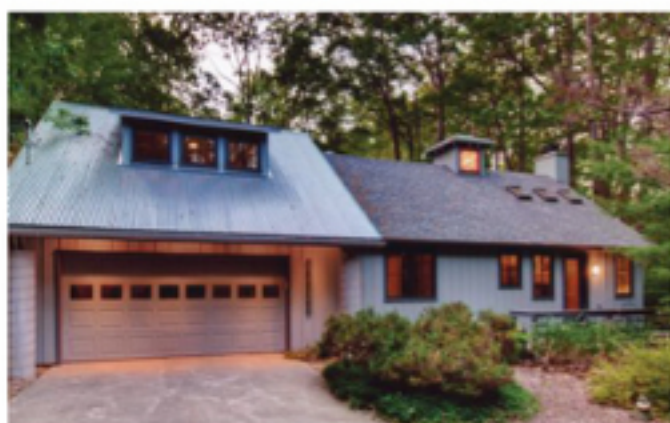
SILVER WHOLE HOUSE UNDER $300,000 Custom Design/Build, Ann Arbor, Mich.

Faucets: Hansgrohe Insulation: Georgia-Pacific Kitchen appliances: Kitchenaid